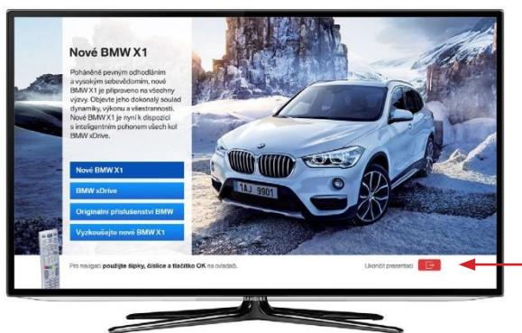
Figure 3 Example of navigation bar.

Inform the user on how to control the application, e.g. through the navigation bar (fig. 3, 4), or through well chosen graphic elements (fig. 5).