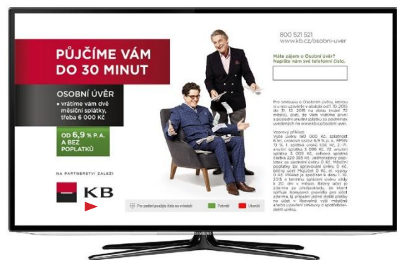
Figure 4 Example of navigation bar.