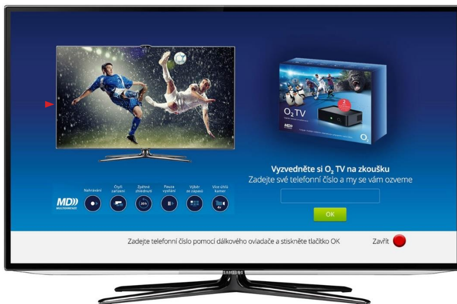
Figure 7 Use of video in HbbTV advertising application.