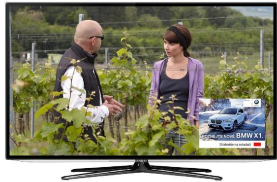
Figure 9 Red button icon (300 x 300 px).