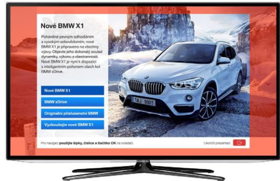
Figure 2 Safe zone (1024 × 648 px). Area outside the safe zone is shown in red.