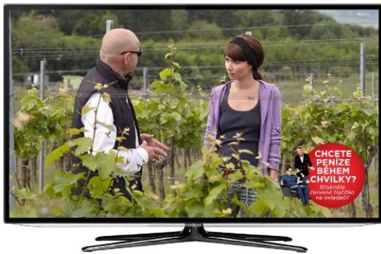
Figure 8 Red button icon (300 x 300 px).

The design of the red button icon may actually determine whether the user decides to run the application or not. It should be attractive enough to motivate the user to open the application. When designing the red button icon, bear in mind that you can never tell beforehand what the background around the icon will look like.