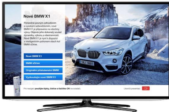
Figure 1 The entire application (1280 × 720 px).

Standard fixed dimensions of 1280 x 720 px (fig. 1) are required for the graphic design of the application. It is necessary to respect the size of the so-called safe zone of 1024 x 648 px (fig. 2). All the application's key elements must be placed within the safe zone to ensure the viewer sees all that is important. Only background or auxiliary graphic features may extend outside that zone.